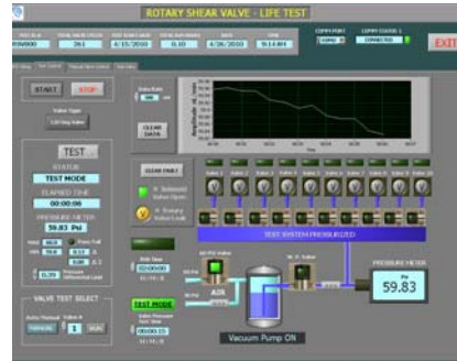
Figure 2 - LabView Control Screen